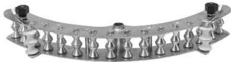
K-468J-2A (two rows)