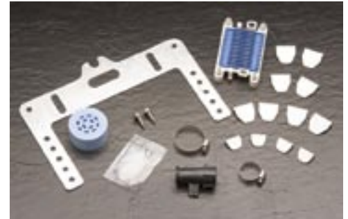
Figure 1 - Kit Components