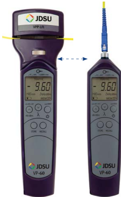
FI-60 Live Fiber Identifier VP-60 Optical Power Meter