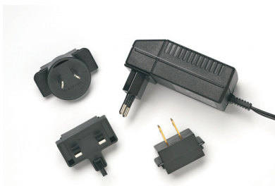
Worldwide compatible AC adapter/charger (SNT-121A)